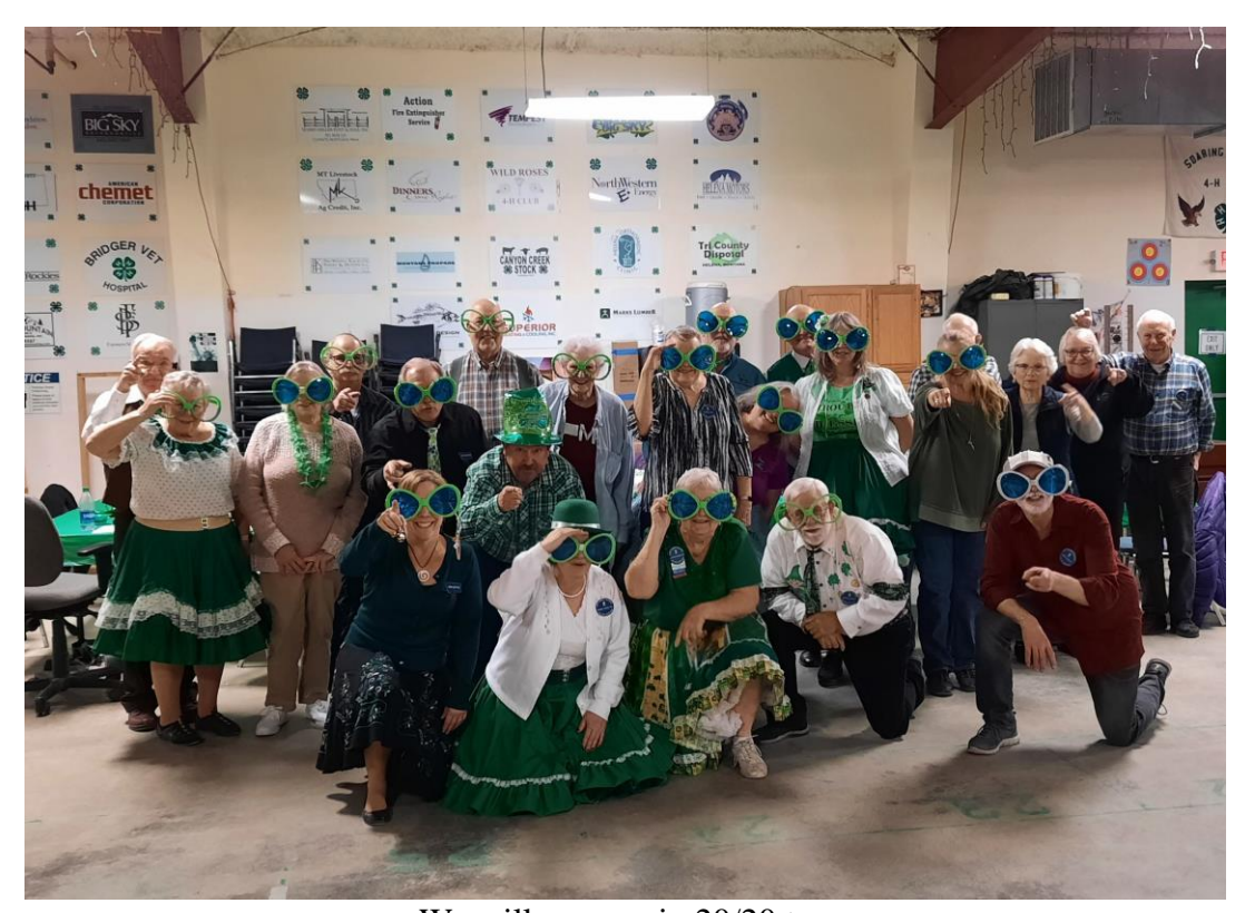
We will see you in 20/20 too